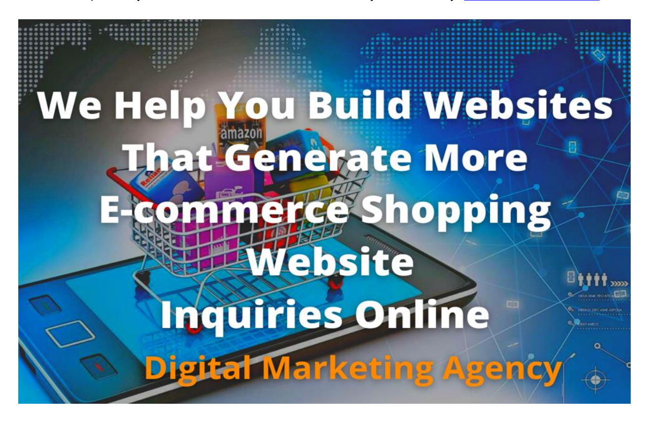
"Achieving Customer Satisfaction By Providing Best Quality Service"

At SRN Info Soft Technologies Only through proper communication can we properly review the individual needs of our clients? SRN Info Soft Technologies Provides complete IT Solutions & IT Security. SRN Info Soft Technologies has empowered you with the latest technology, expertise as well youth people in the workforce to provide you best solutions in terms of functionality and creativity. <a href="https://www.srninfosoft.com">www.srninfosoft.com</a>